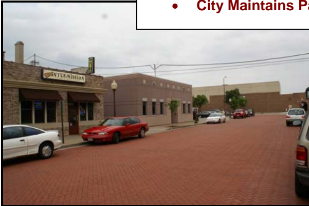
View from Downtown Center of Wausau